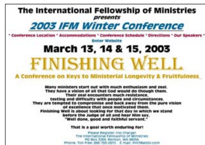
A significant opportunity for God to impart practical application of ministry to us all

This was a great time to network with new folks and to meet up with old friends too. God made this time special for me by confirming a number of things that had been on my heart.